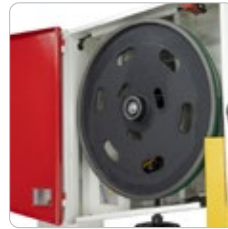
Band Saw Wheel (Flywheel)