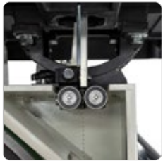
Lower Blade Guides