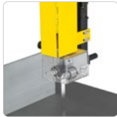
Upper Blade Guide & Guard